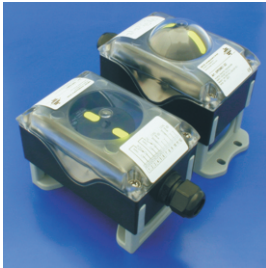
Model EPP (S. 1)