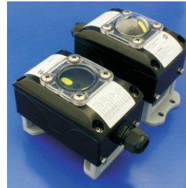
Model EAP (S. 5)