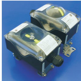
Model EPE (S. 2)